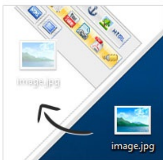
works in all major browsers

2 Paste snapshots of your screen or its part