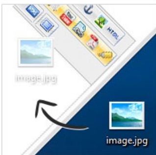
works in all major browsers

3 Paste selections from your favorite editor