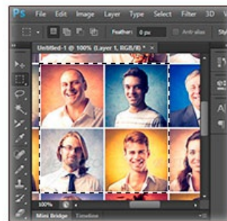
works in Chrome in Firefox