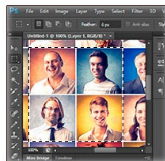
works in Chrome in Firefox

3 Paste selections from your favorite editor